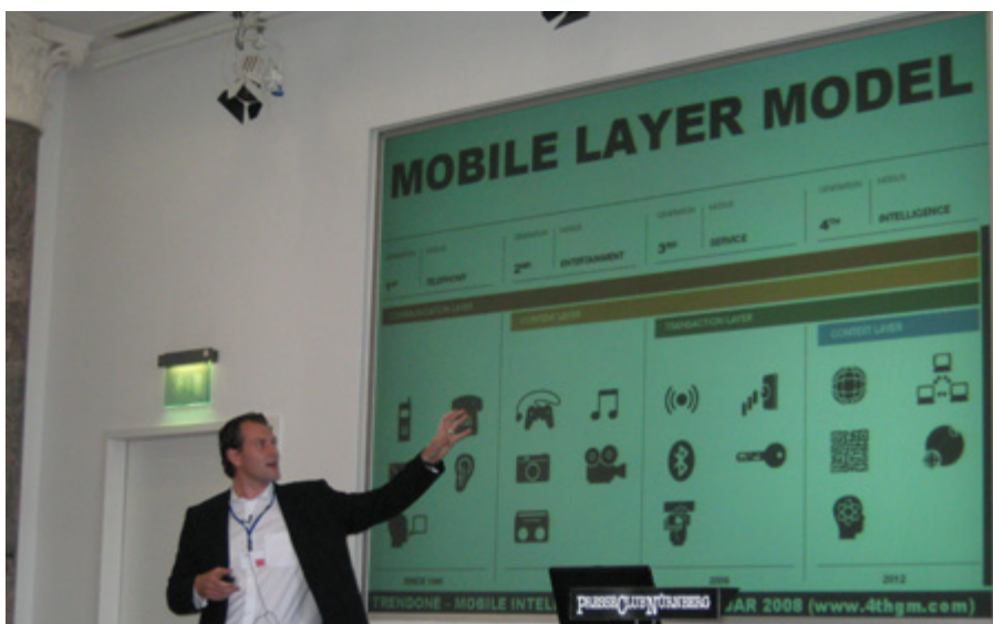
Mobile Intelligence at University Nürnberg, October 2008