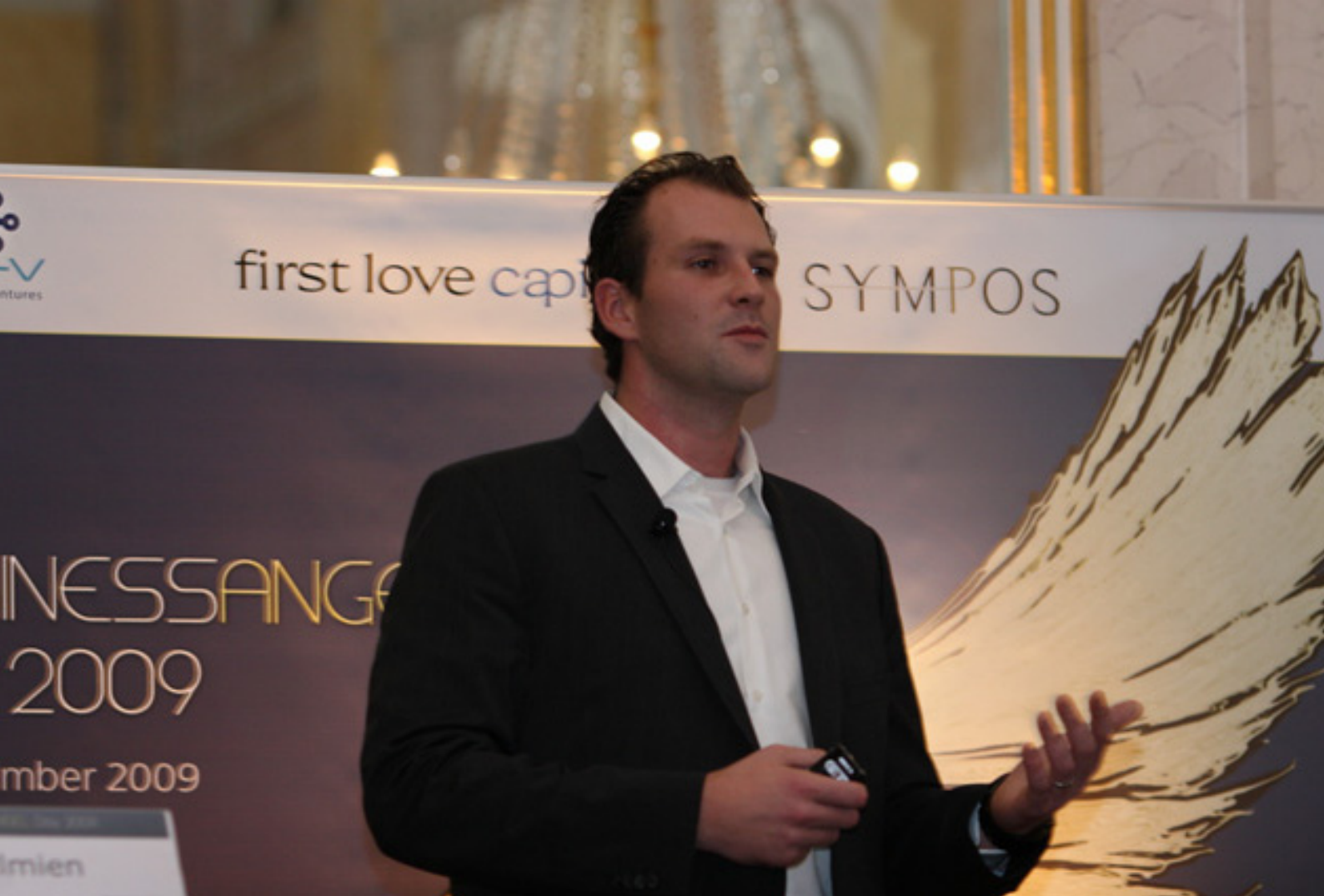
Business Angel Day, November 2009