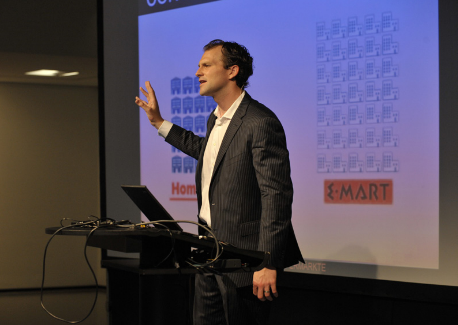
Future Work Place, Dresden, July 2011