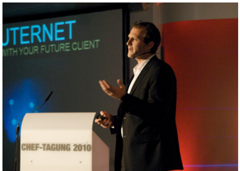
KATAG Cheftagung 2010, Bielefeld