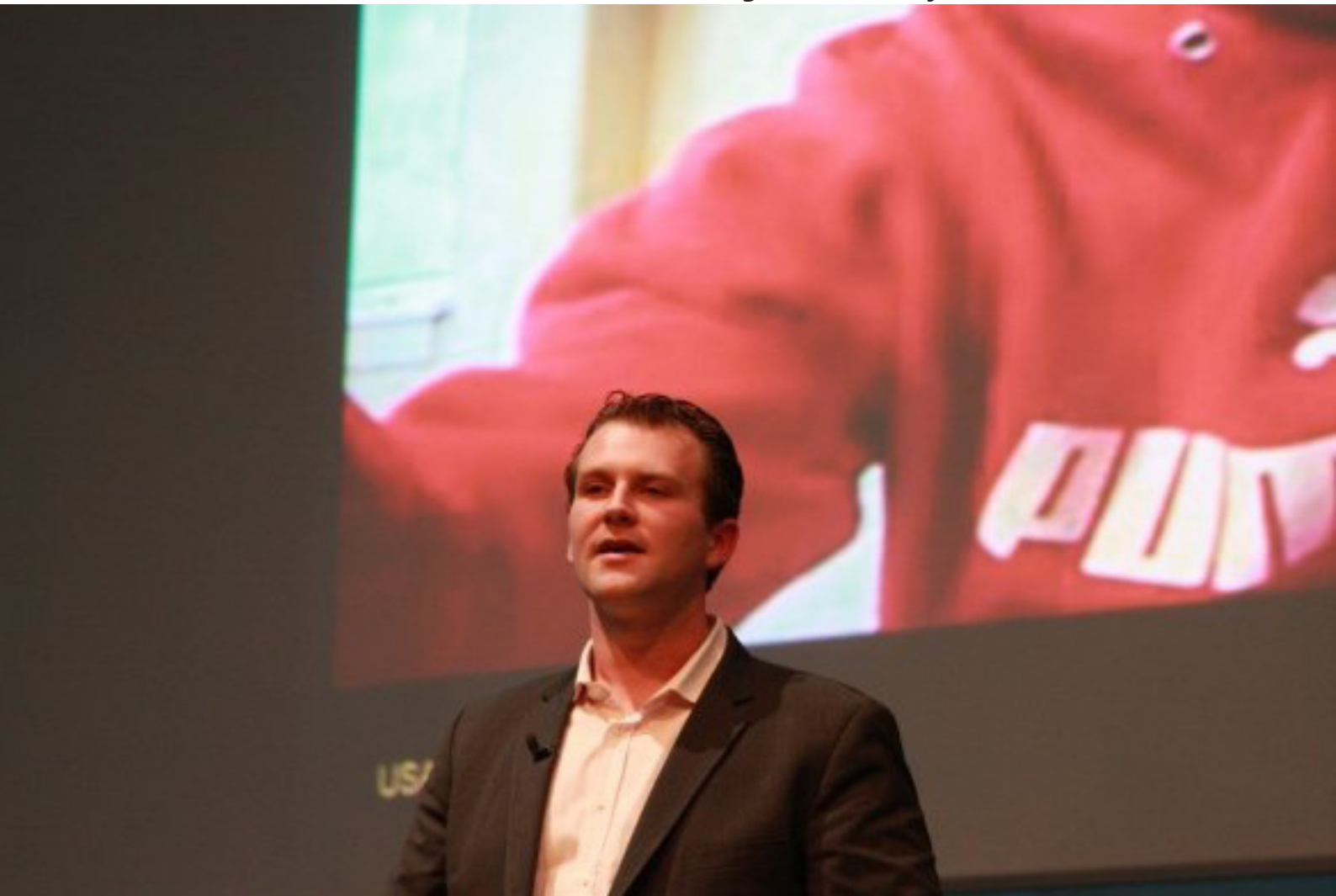
Digital Media Day at Deutsche Post, March 2009