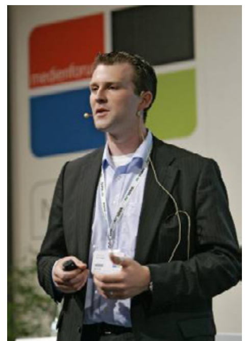
Medien Dialog, Cologne, June 2007